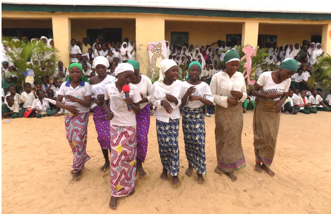
LEA Unguwan Rimi Students performing a traditional dance