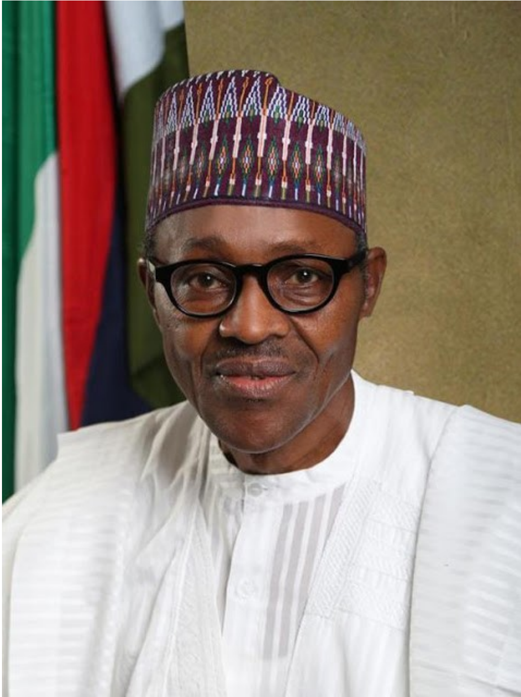
His Excellency President Muhammadu Buhari