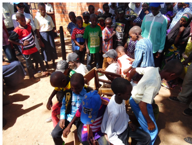
PLAYING MUSICAL CHAIRS