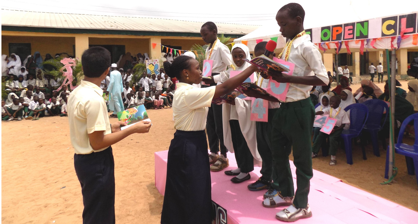
The Reading Recital by Primary 3 Students of LEA Unguwar Rimi

Founded in 2002 at ESSENCE INTERNATIONAL SCHOOL and THE AFRICAN HERITAGE VILLAGE KADUNA, NIGERIA August, 2016