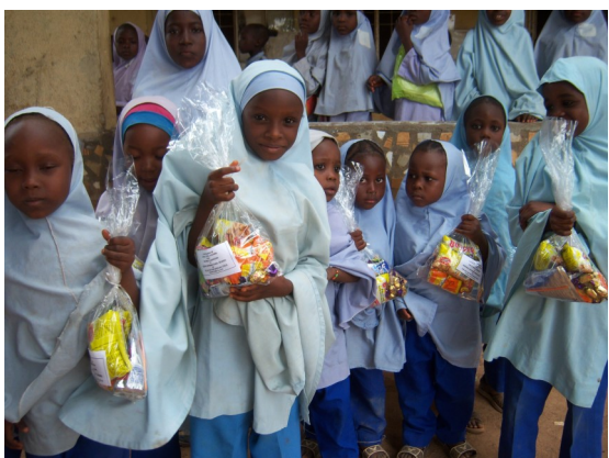
THDFN Students with Fun Packs