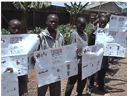
left: The Open Classroom in Kenya- Children in an orphanage in Nairobi complete an Open classroom portfolio post-