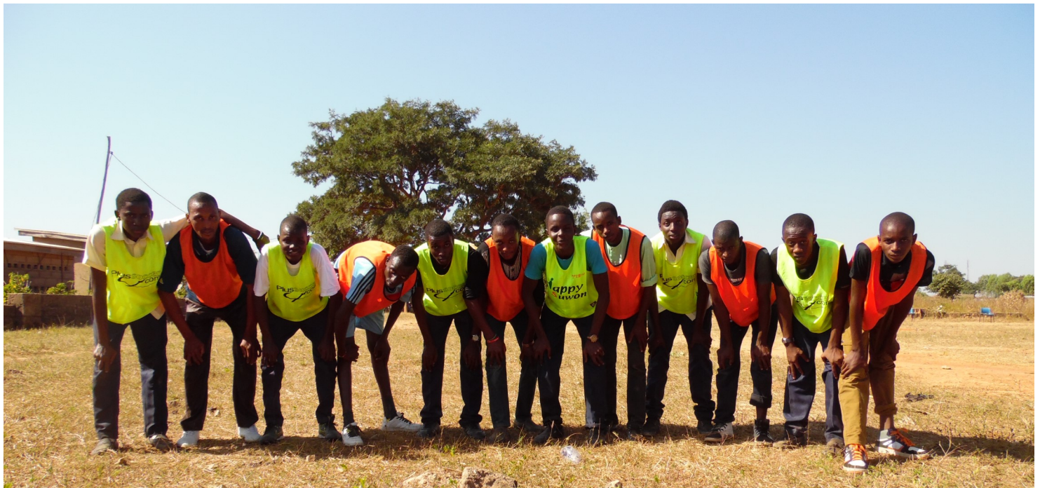
PLAYING FOOTBALL AT RUGAN FULANI

step. It is an awareness that we all have- because we see the inequities in society- but we tend to postpone or push aside opportunities to get involved. We want more of our young people to see the importance of their contributions in bringing inspiration to their peers in underserved communities. This is a critical aspect of nation building. Below are some pictures of Essence students playing with their friends at Rugan Fulani.