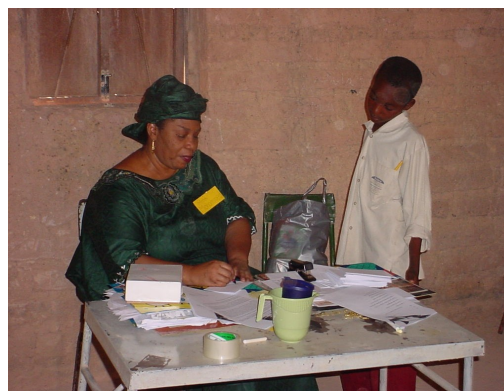
Teaching in Zinder, Niger