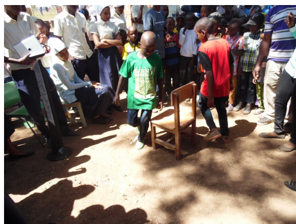
PLAYING MUSICAL CHAIRS

THIS IS A GAME THAT THE CHILDREN IN RUGAN FULANI LEARNED THROUGH THEIR FRIENDSHIP WITH THE CHILDREN AT ESSENCE INTERNATIONAL SCHOOL