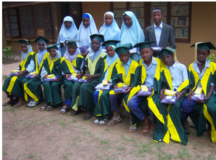
Primary 6 graduating students of THDFN

The Open Classroom has a very valuable and time-honored relationship with THDFN (Taimako Human Development Foundation of Nigeria). Some of our children perform community service activities there and we normally hold a yearly Thanksgiving celebration (Turkey Day) where interesting games are played with the children after a few classroom lessons, followed up by a special take-away dinner with sweets.