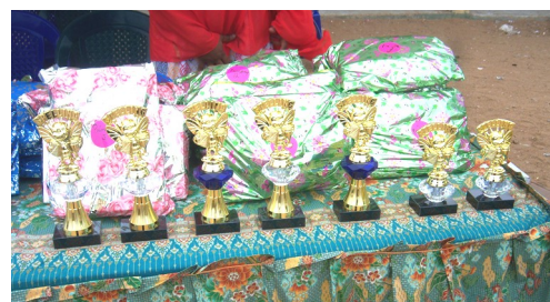
LEA Unguwar Rimi Spelling Bee contestants were competing for these prizes and trophies.

Essence International School has a long and cordial sister school relationship with LEA Unguwar Rimi. This is the 11th year of the Spelling Bee which is hosted by Essence in cooperation with LEA U/Rimi. Students from primary 1 to 6 participate in the Bee and teachers from both schools are involved in training the students who have special reading, spelling and writing lessons. Much emphasis is placed on listening skills, pronunciation, and reading aloud with the proper inflection. They are also groomed to speak in front of an audience without getting nervous or losing their confidence.